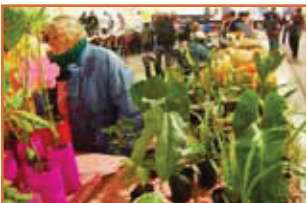
AGRICULTURA URBANA PROJECT