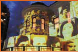
THE MUSEO DE LA MEMORIA