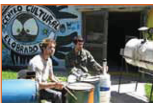
THE TOBA'S COMMUNITY PROJECT