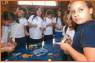
THE CHILDREN'S PROJECT