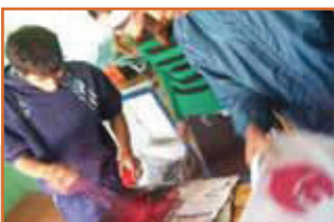
THE INCLUSIÓN SOCIAL PROJECT