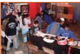
CENTRO CULTURAL LA GRIETA